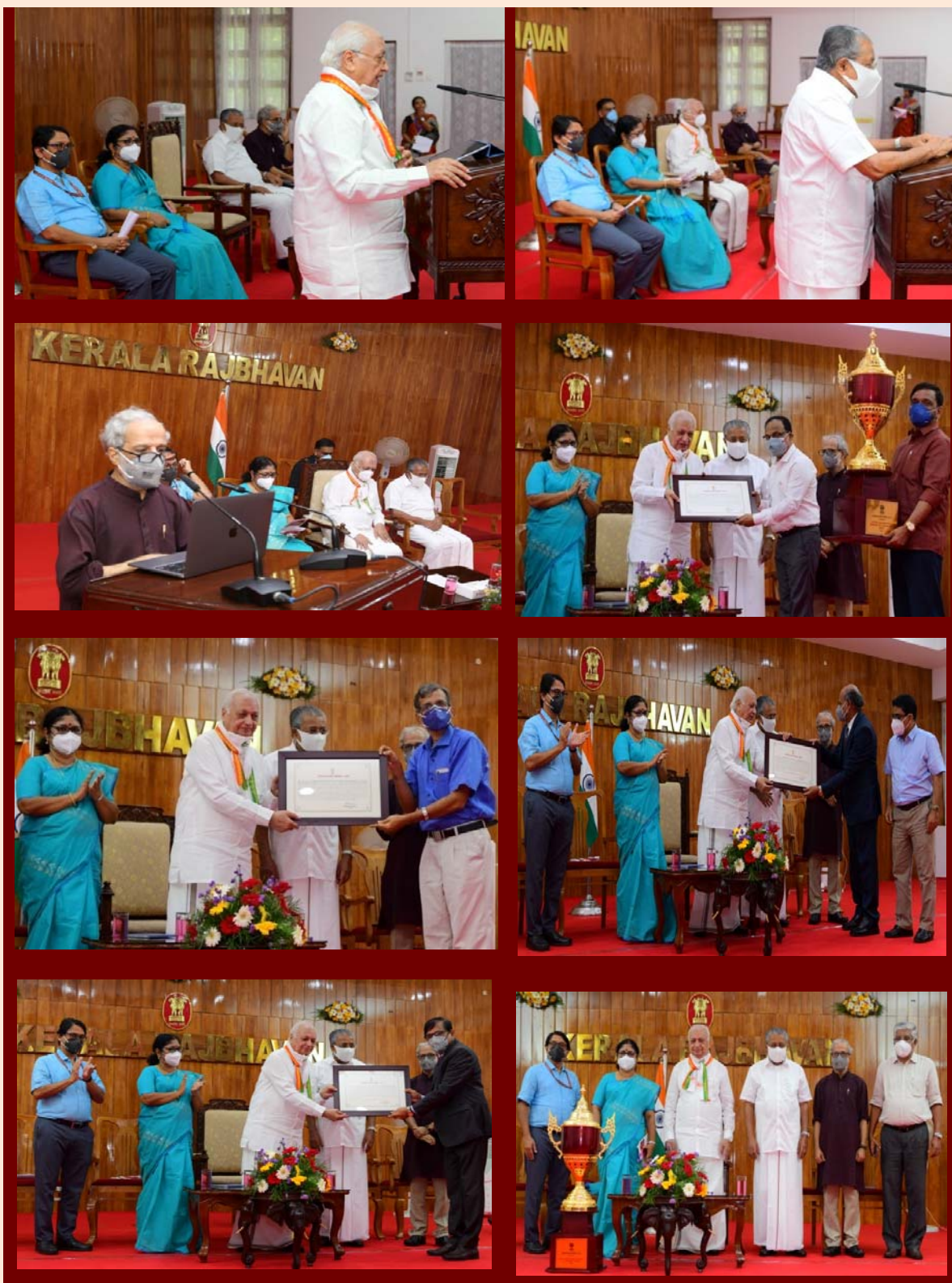
The Chancellor's Award ceremony held at Kerala Raj Bhavan