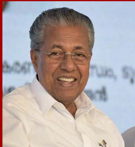
Shri. Pinarayi Vijayan Hon'ble Chief Minister of Kerala