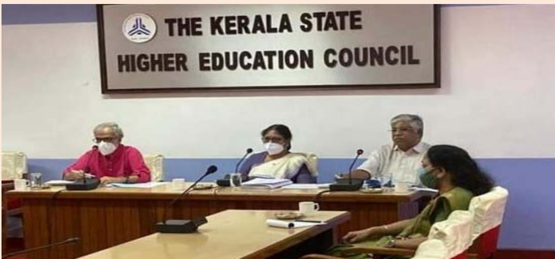
Governing Body Meeting of KSHEC