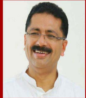
Dr. K. T. Jaleel