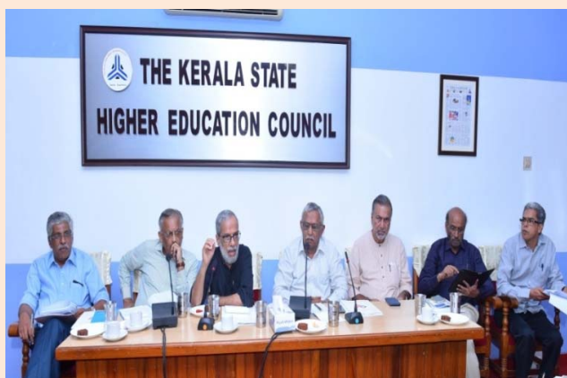
Consultative Meeting on SAAC held on 27 th May, 2019 at Board room of KSHEC, Thiruvananthapuram

It envisages to stimulate and promote the horizontal and sustainable development of all higher education institutions of Kerala by employing transparent and methodical measuring means having global, national, state level, regional and local bearing, with prime focus on quality, excellence, competency, adaptability, inclusiveness and social/ development linkage.