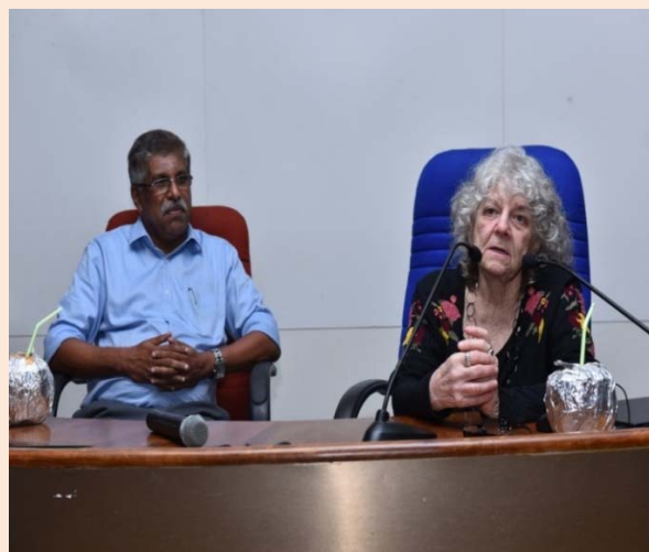
Erudite Lecture by Prof. Ada E. Yonath (Nobel Laureate in Chemistry in 2009) at the Senate Chamber, University of Kerala.