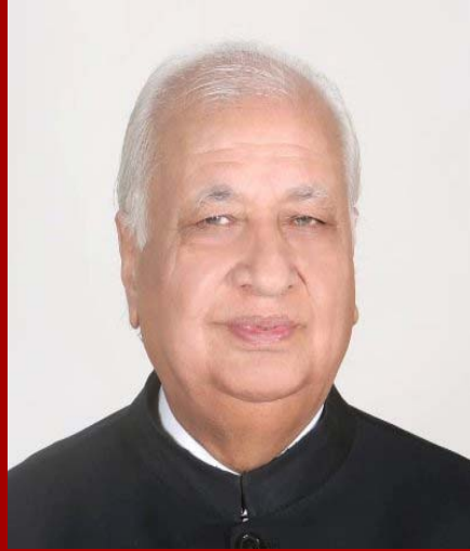
Shri. Arif Mohammed Khan Hon'ble Governor of Kerala