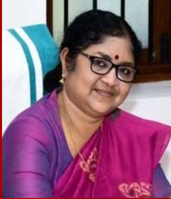
Dr. R. Bindu Hon'ble Minister for Higher Education