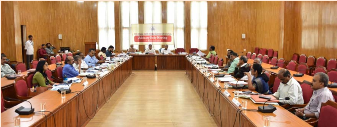
Advisory Body Meeting of KSHEC held on 17 th November, 2018