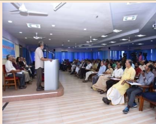
National Seminar on "National Education Policy 2019" held at Thiruvananthapuram