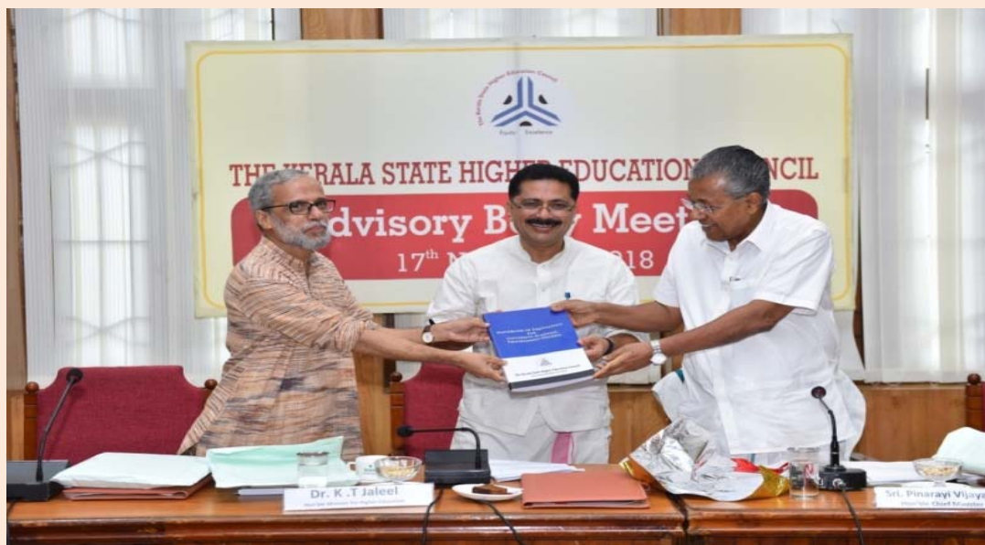
Hon'ble Chief Minister of Kerala Shri.Pinarayi Vijayan releasing "Handbook of Equivalency for Academic Programmes/Degrees of Universities" in the Advisory Meeting of KSHEC.

Addressing the students' nagging problem due to the insistence of equivalency certification of their Degrees and Academic Programmes by universities and the State Public Service Commission the KSHEC prepared a comprehensive handbook titled Handbook of Equivalency for Academic Programmes/ Degrees of Universities .