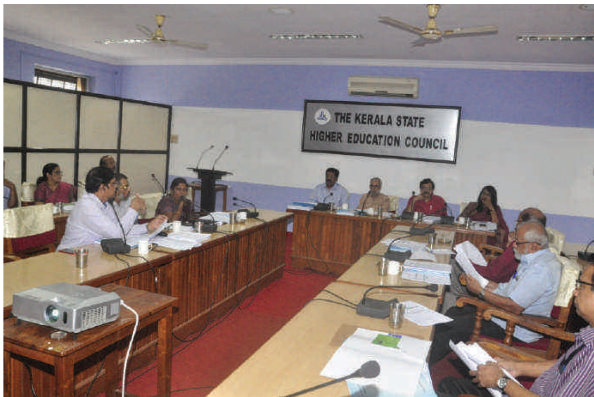
Meeting of the Governing Body held on July 25, 2018

Three meetings of the Governing Body of KSHEC were held on 16/05/2018, 25/07/2018 & 03/10/2018 during the report year (2018-19)