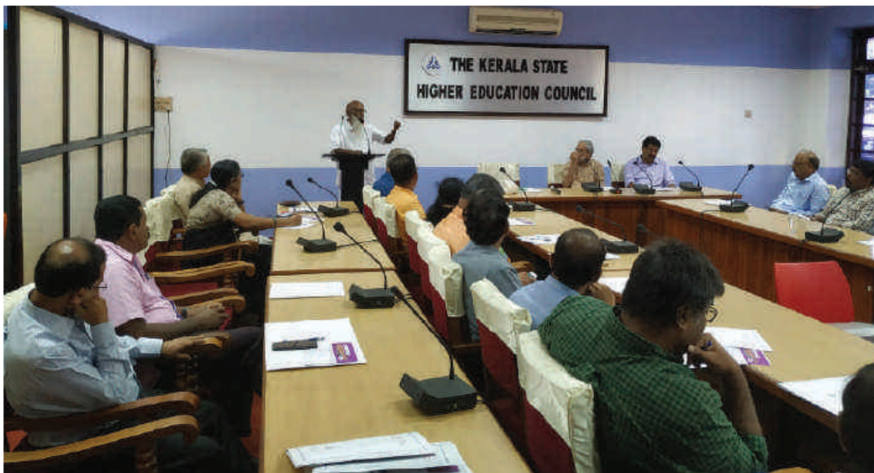
Participants at the Conference on Social Preparedness of Disaster Management and Geo-scientific Strategies