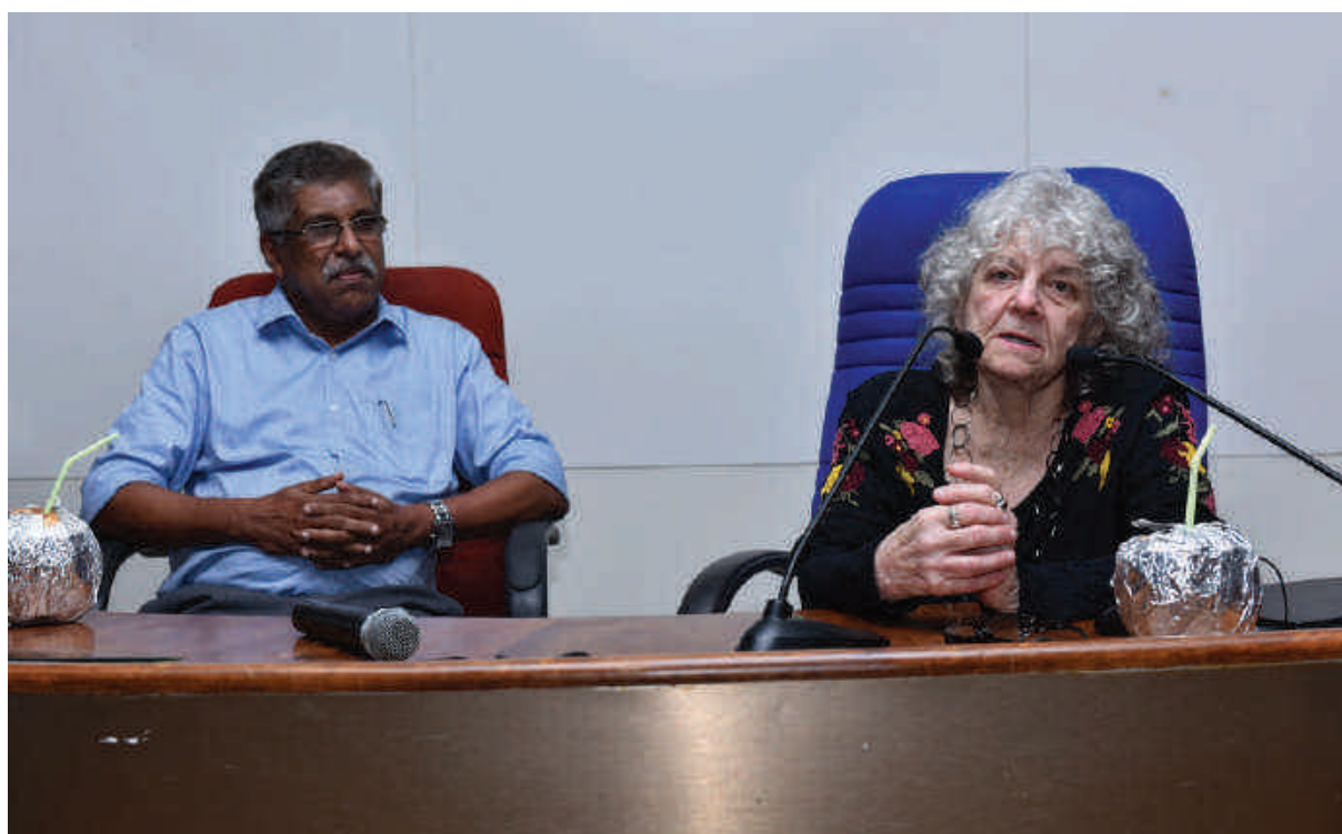
Erudite Programme of Prof. Ada E. Yonath -Nobel Laureate in Chemistry at the Senate Hall, University of Kerala