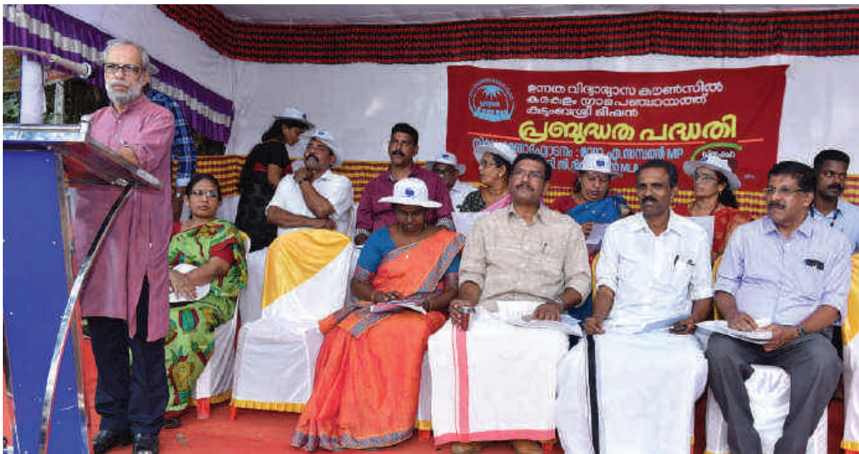
Inauguration of the Prabudhata Programme at Karakulam Panchayath