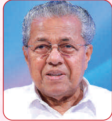
Shri. Pinarayi Vijayan Hon'ble Chief Minister of Kerala