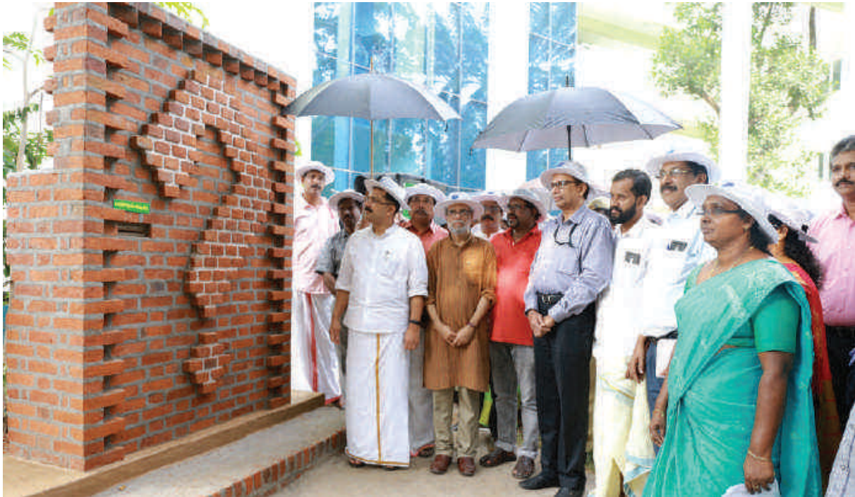
Launching of the Prabudhata Installation at the University of Kerala, Palayam Campus