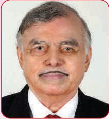
Shri. Justice(Retd.) P. Sathasivam The Hon'ble Governor of Kerala