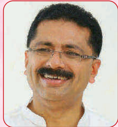
Dr. K.T. Jaleel Hon'ble Minister for Education