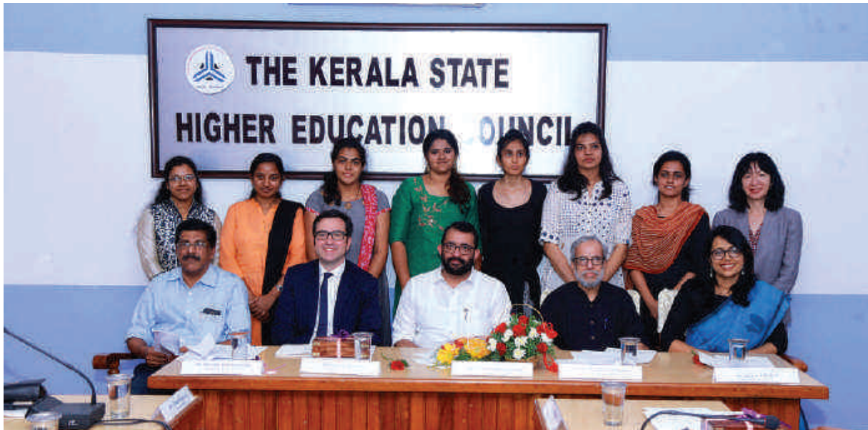
Awardees of the British Council 70th Anniversary Scholarships