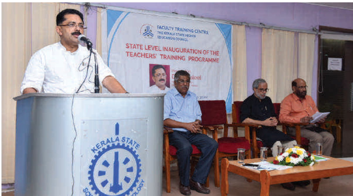
Inauguration of the Faculty Training Programme